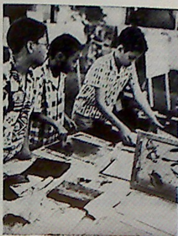
ART IN SCHOOLS—Art skills as well as the appreciation of art are taught in schools. Here middle school students experiment with linoleum block printing in Honolulu, Hawaii.