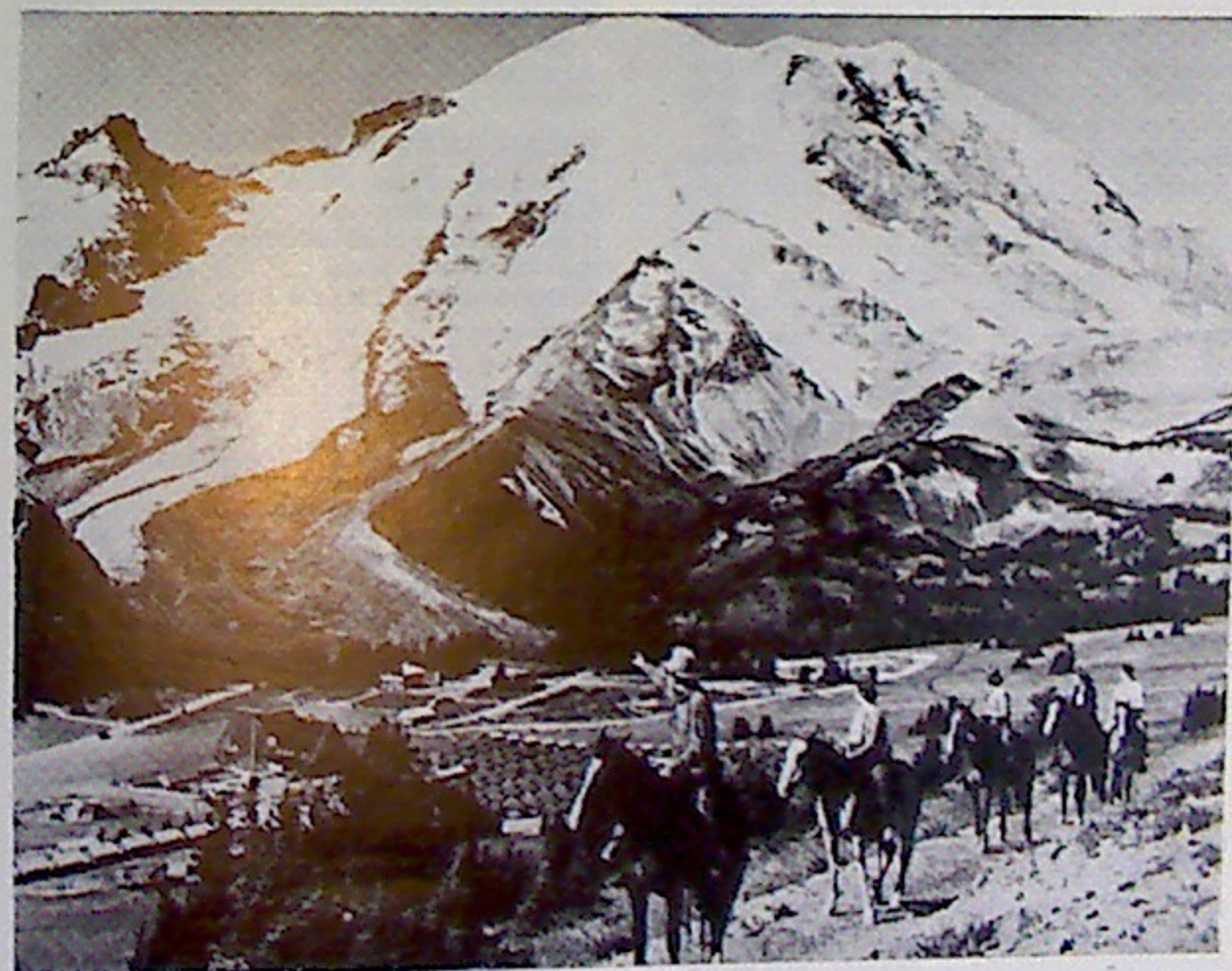
A VARIED LAND—The United States is a land of forests, deserts, mountains, plateaus and fertile plains. Though most of it is in the temperate zone, the climate ranges from Arctic cold, in the northern tip of Alaska, to the sunny, subtropical warmth of Hawaii, Florida and Texas.

Shows spectacular scenic beauties of the new State of Alaska and provides background on life within the Arctic Circle: its main