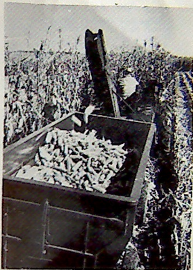
MACHINES HELP PRODUCE FOOD.— The United States uses 62% of the land within its continental limits for farms and ranches. Some four million tractors are in use; the number of grain combines has increased to one million, two hundred thousand, and the number of electric milking machines has more than tripled since 1940.