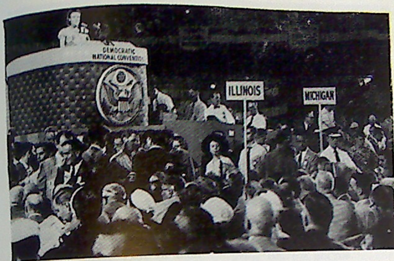
PEOPLE SHAPE THE GOVERNMENT —Through free elections, the people of the United States choose their representatives in State and Federal Government and thus are able to influence directly the domestic and foreign policies of their country. At political conventions held by the two major political parties, the Republican and Democratic candidates for President and Vice-President are chosen.