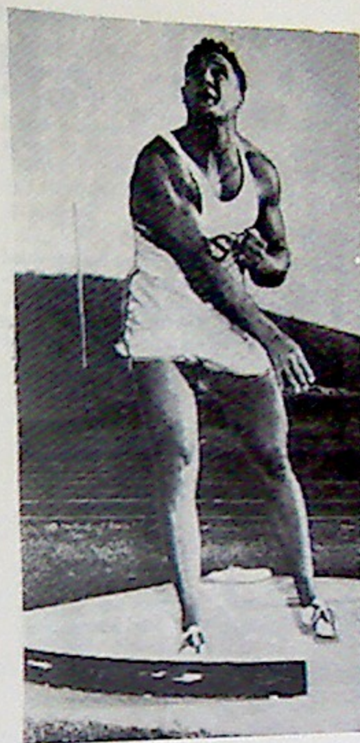
ATHLETICS ARE IMPORTANT —Athletics are enjoyed by millions of secondary and university school students. Many athletes like Parry O'Brien (above) who holds the all-comers shot-put record for Ghana continue to participate after their scholastic days.