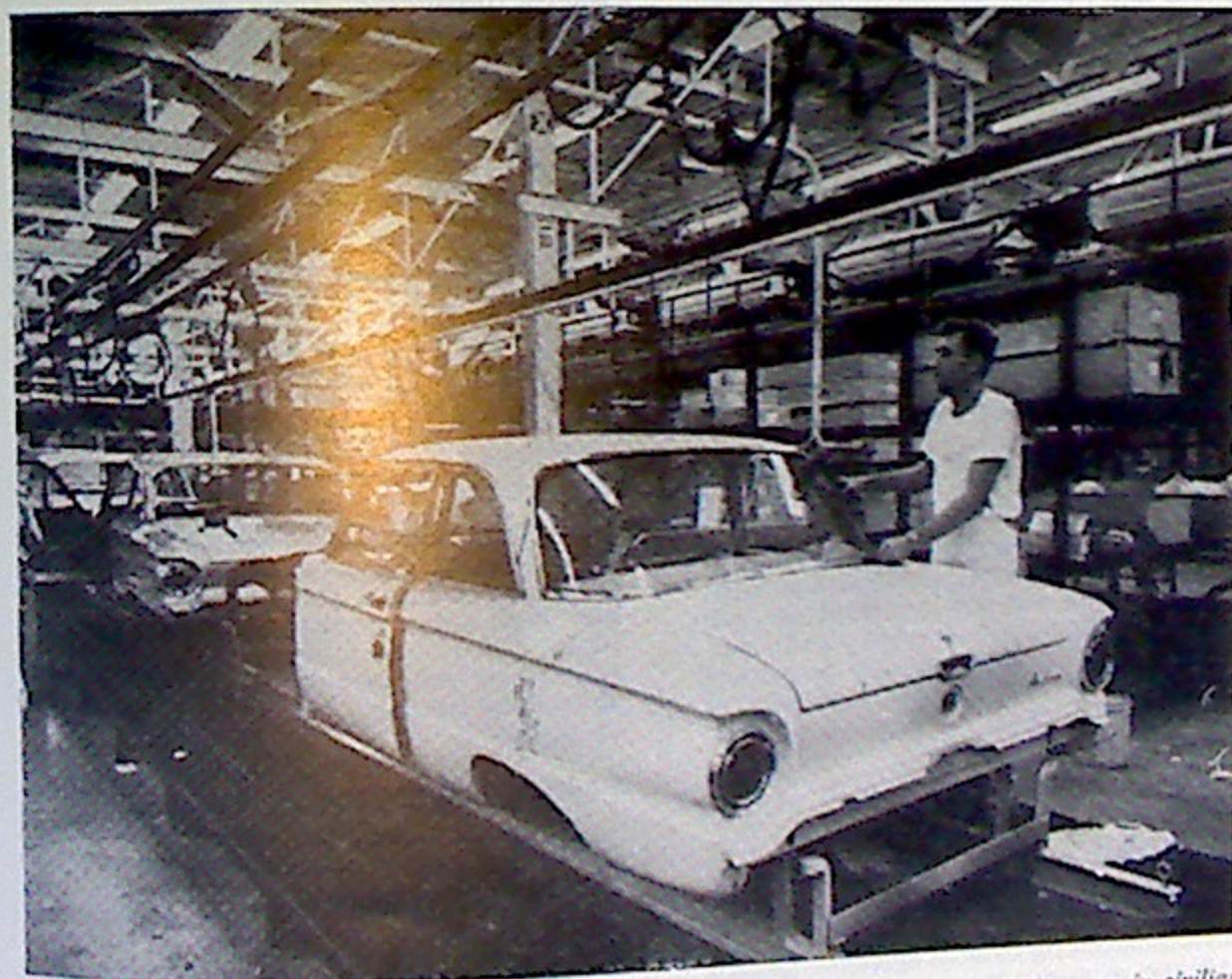
A NATION OF WORKERS —In a population of 178 million more than 65 million are in civilian employment. Eighteen million are union members. More than 90% of the employed are covered by Federal Government social security, including unemployment, retirement and disability programmes. The balance of the work force are covered by other protection plans.

Describes the making of books from the cutting and folding process through that of stitching, trimming, compressing and case-making (the application of the covers). Included is the process of making pamphlets, ruled notebooks and ledgers; forms and record books for the accountant. An especially interesting aspect of the film is a description of the art of the restoration of books with its requisite for infinite patience and painstaking attention to detail. 13 minutes.